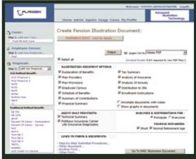
Simple, fast "point and click" interface for illustration print-outs, section by section.

more effective proposals with PlanGen. It can be accessed anytime, anywhere, without any special software or CDs. PlanGen offers the simplicity of standardized data input – no more multi-page "fact finders" for preliminary studies. An electronic form is all that is needed to capture participant census requirements.